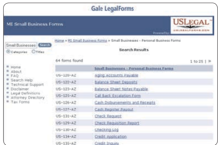
▲ Personal business forms - such as balance sheet deposits - are included in the small business forms package