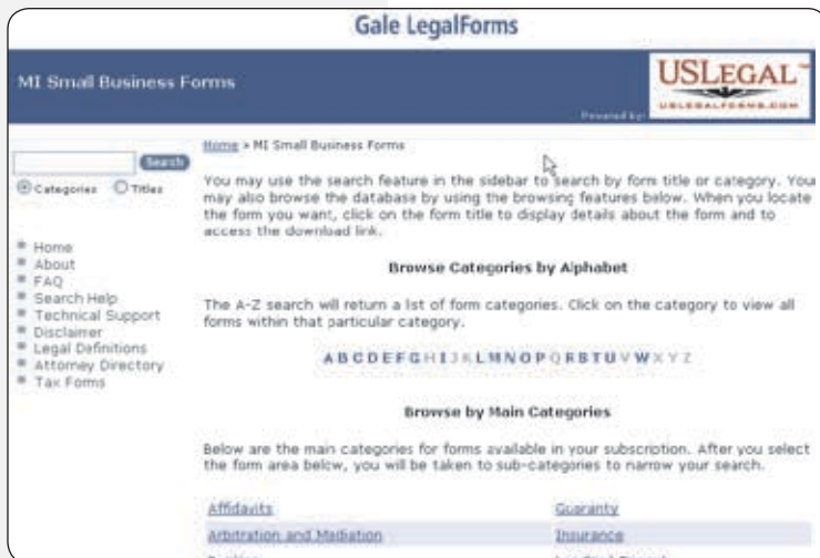
▲ Dozens of small business forms are easily accessed from the home page

Standard legal tasks such as filing patents and trademarks may not require the full services of an attorney, thanks in part, to Gale Business Forms . This online resource delivers everything business owners need to take charge of their legal affairs with confidence. No special skills or extensive knowledge of the law is required because Gale Business Forms offers an easy-to-use, step-by-step