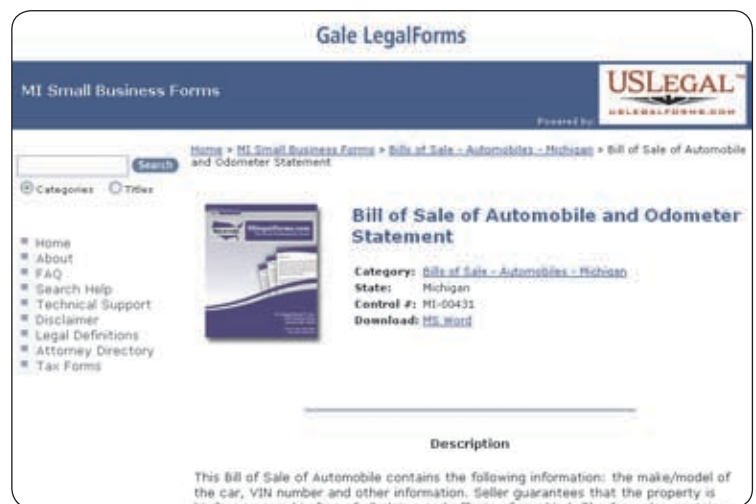
▲ All forms are easily downloaded and completed in the most commonly used applications such as Word