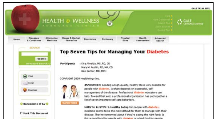
▲ Media-rich content includes hundreds of streaming videos from experts in the field.